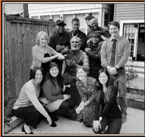
Jubilee Jobs Staff 2018